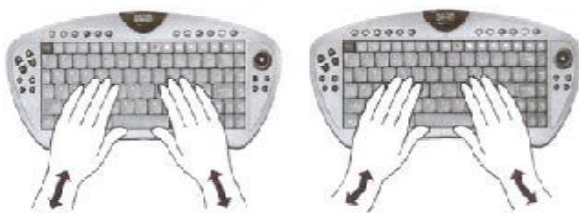
Correct wrists straight